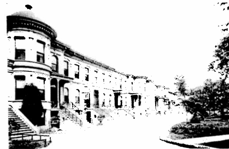
The 1870s saw increased construction of row houses as in the aftermath of the Fire of 1871 as Chicago's population increased dramatically in outlying neighborhoods. Middle: Aldine Square, a row house development next to a private park (demolished), was built in Chicago's Douglas community area on the South Side. Bottom: A significant early example of row house development that survives in Chicago is the Burling Row House District in the Lincoln Park neighborhood, built in 1875 and designed by Edward J. Burling, the architect of the Fremont Row House District.